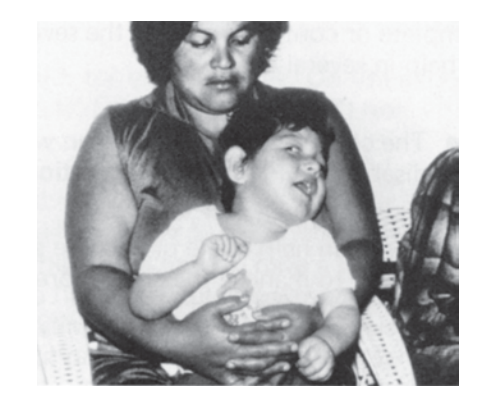
A child with severe cerebral palsy, who is also blind, has seizures, and is mentally slow.

Caring for multiply and severely disabled children is never easy; they need an enormous amount of time, patience, and love. In most communities, parents and close family members will be the main care providers. But parents will need a lot of support from the community in