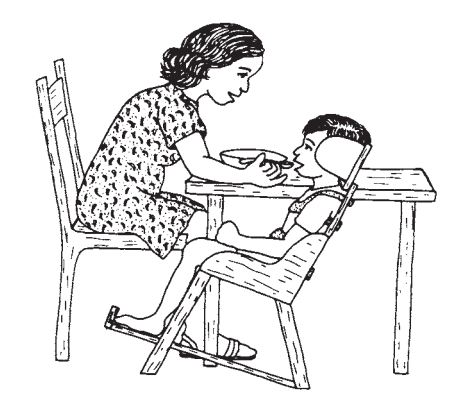
Special seating can help the severely disabled child by supporting him in a position where he has better control.

Special seating and positioning, discussed in Chapter 65, may help the child to have more control of her body. This can make feeding, basic communication, and other activities easier.